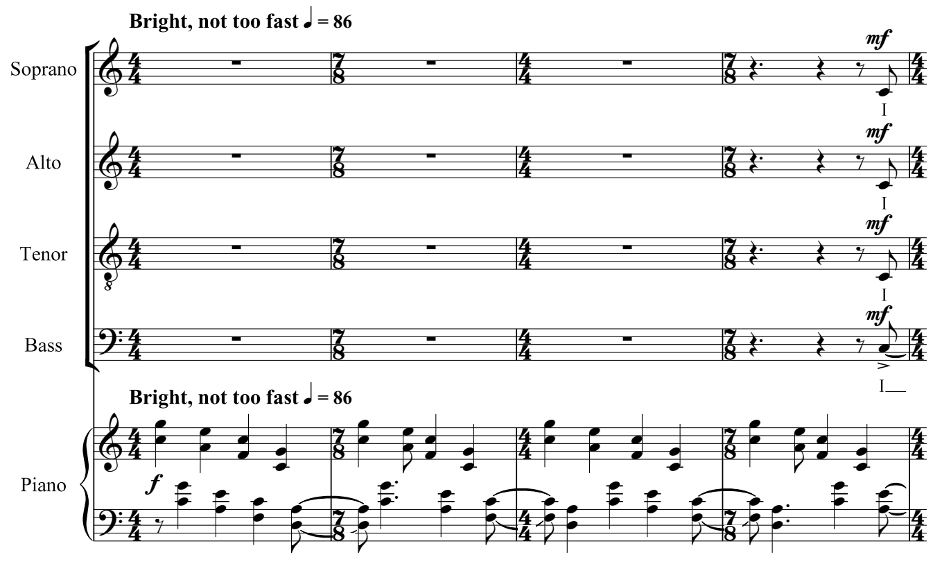
(use the sustaining pedal freely to blur the chiming)