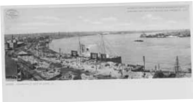
Vintage postcards of New Orleans