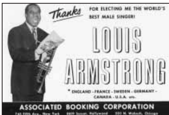
Magazine ad, 1954

Louis Armstrong was also a remarkable singer. According to Satchmo himself, while recording “Heebie Jeebies” in Chicago on February 26, 1926, the sheet music fell off the stand. Louis did not want to stop the recording session, so he continued singing, using nonsense syllables and making sounds similar to an instrument. The result was the first recorded example of what became known as scat singing, a jazz vocal practice still very popular today.