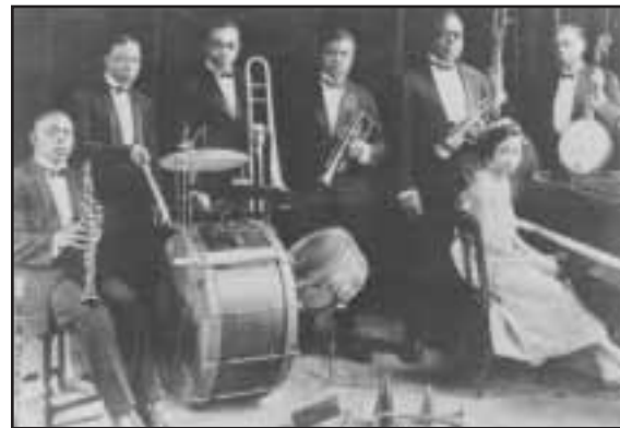
King Oliver's Creole Jazz Band

earned Louis the nickname “Satchmo,” short for satchel mouth, because of his huge cheeks and wide smile. Later, Louis recorded the popular “West End Blues” and “Struttin’ with Some Barbecue.”