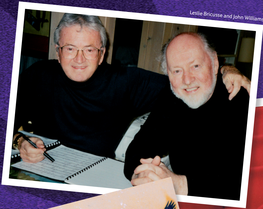
Leslie Bricusse and John Williams