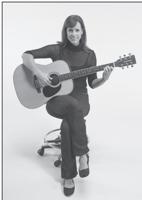
Acoustic: right leg over left knee