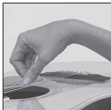
Wrist too high (over-arched).