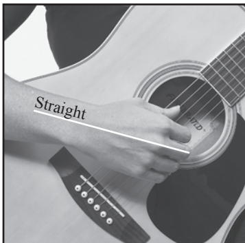
Note the straight wrist.