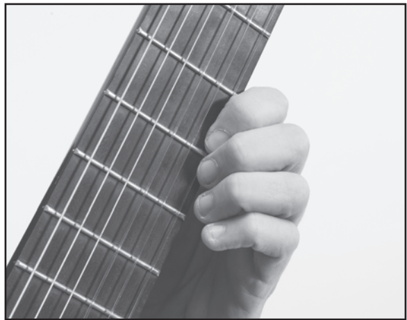
Fingers clumping together