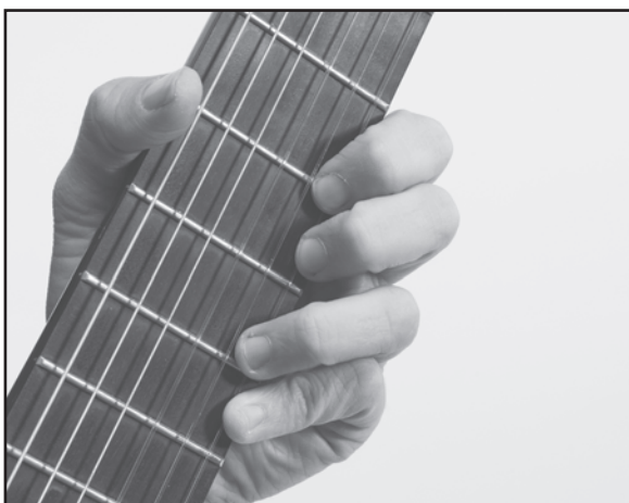
Thumb grabbing over the fretboard