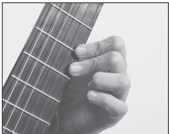
Collapsing fingertip joints