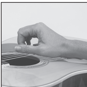
Wrist too low.