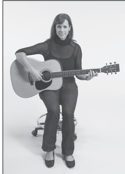
Acoustic: guitar on right knee