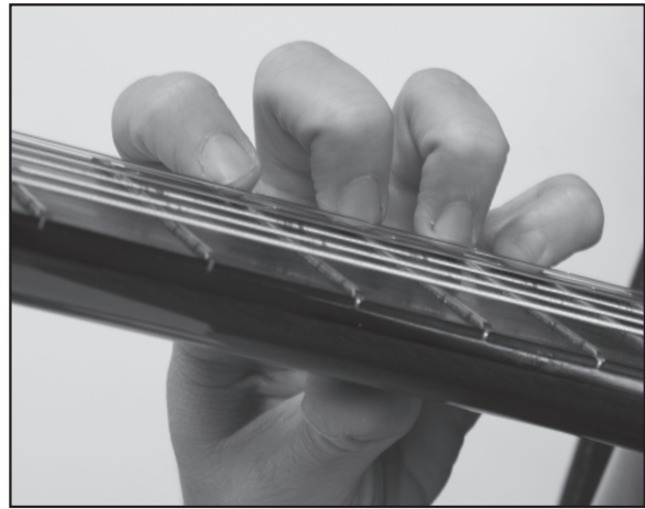
Thumb behind the back of the neck