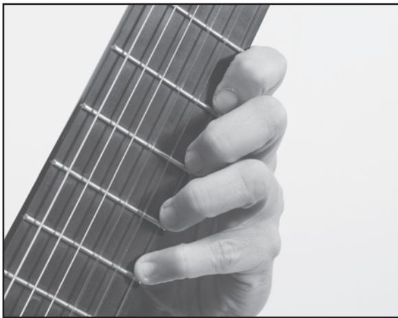
Fingers leaning to the left