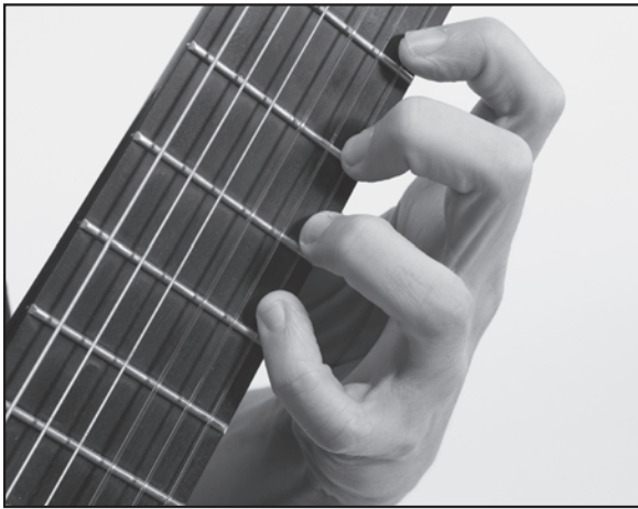
Fingers are independent of each other with the fingertips just behind each fret