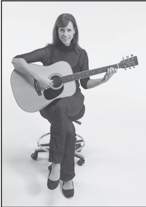
Acoustic: left leg over right knee

When reading music and improvising (the process of creating music on the spot), your hands will adjust more quickly if you use the classical sitting position. When playing chords, you can sit in a more casual position, or stay in classical position as you wish.