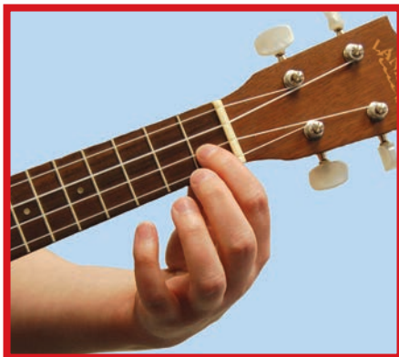
▲ RIGHT Finger pressing the string down near the fret without actually being on it.

When you press a string with a left-hand finger, make sure you press firmly with the tip of your finger and as close to the fret as you can without actually being right on it. Short fingernails are important! This will create a clean, bright tone.